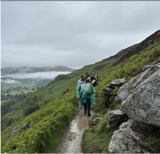
I felt resilient when...

Healthwatch Cumberland are looking for photos taken by young people aged 11-25 to be included in our Youth Mental Health project, R.I.S.E.